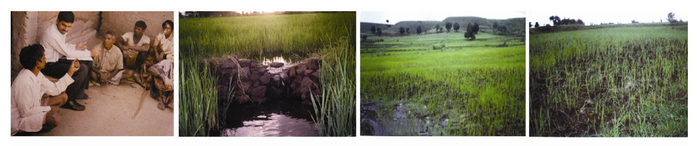
Fig 1-Focus group discussion